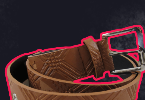
Retailer: AshleyStewart.com | Brand: Ashley Stewart

If you are concerned about a particular fashion accessory, feel free to send your product to CEH for free lead testing.