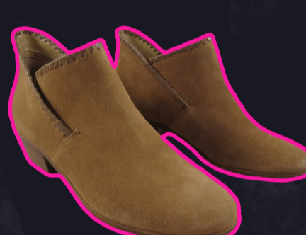
Retailer: Marshalls | Brand: Jack Rogers

In 2017, CEH identified 169 fashion accessories with lead. The five worst fashion offenders were DND Fashion, Asos.com, Elegant Footwear, Forever Link, and Nordstrom.