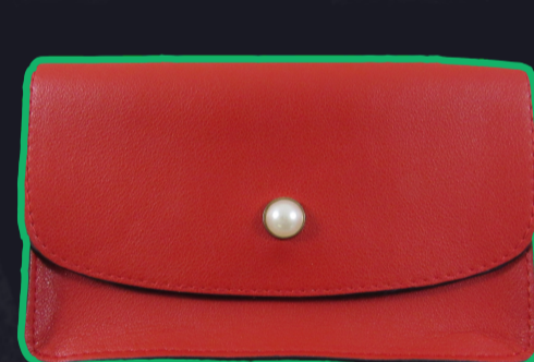
Retailer: Ross | Brand: Perfect Image New York